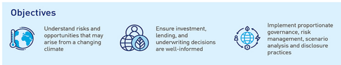
Figure 1. Overview of APRA’s climate change financial risk guidance